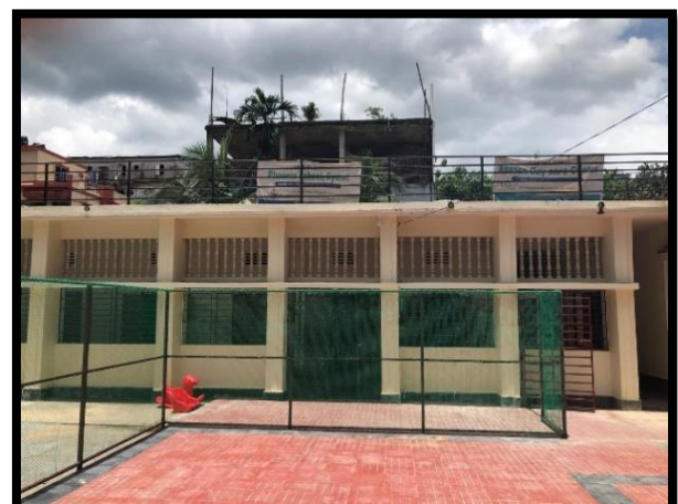
Staff training August 2019 & Phoenix School Sylhet - the new completed building.