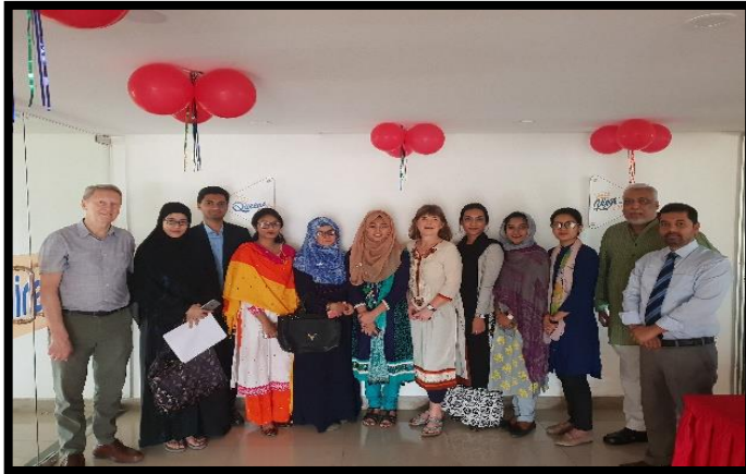
The Phoenix School Sylhet team February 2019.