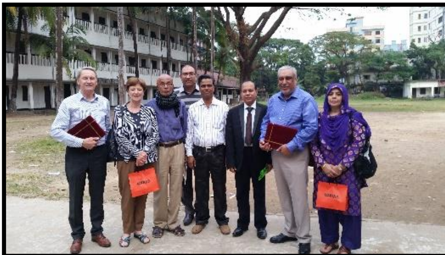
The first visit to Bangladesh in November 2015.

The Bangladeshi diaspora is very strong in East London as are the links between our school community and Sylhet. Parents of children attending Phoenix School London have been very supportive of our plans to start a school for children with autism in Sylhet. We believe that the Phoenix School Sylhet will have a significant effect on our school, families and in turn on our children's learning. It is an initiative that will have positive outcomes across both communities.